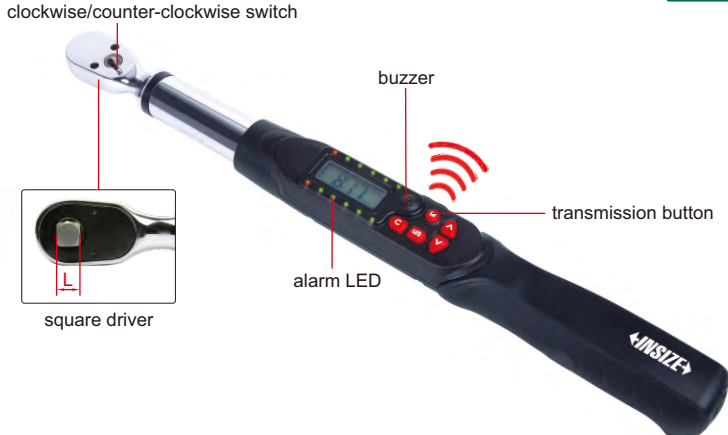
IST-15W135A Type B