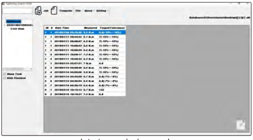
data transmission mode