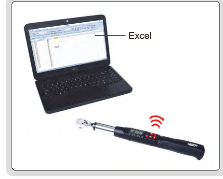
transmission distance is 10 meters (no obstacles, no electromagnetic interference)